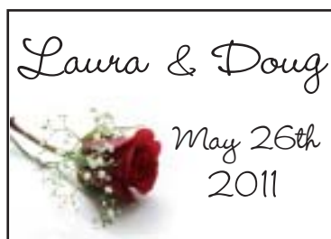
SemiCustom - Rose