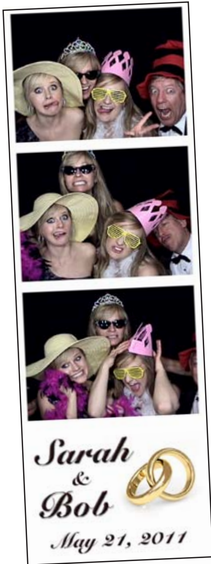
SemiCustom - Rings