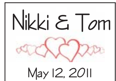
Side by Side - Best with shorter names