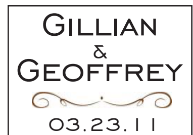
Over Under - Best with longer names